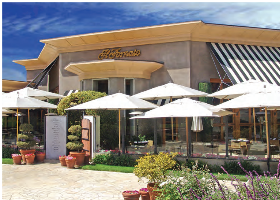
Il Fornaio aspires to bring its guests closer to Italy with each visit to the restaurant.