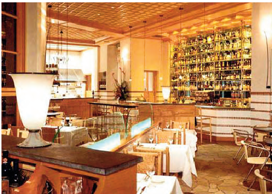
Enjoy authentic cuisine paired with regional wines at Il Fornaio.