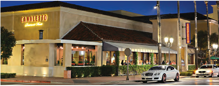
Canaletto is located in Newport Beach's Fashion Island.