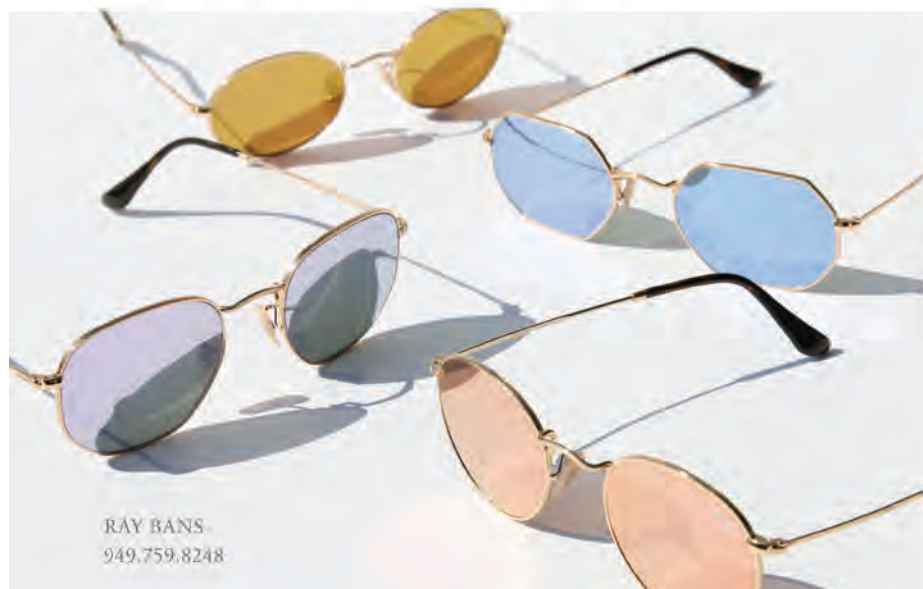
RAY BANS 949.759.8248