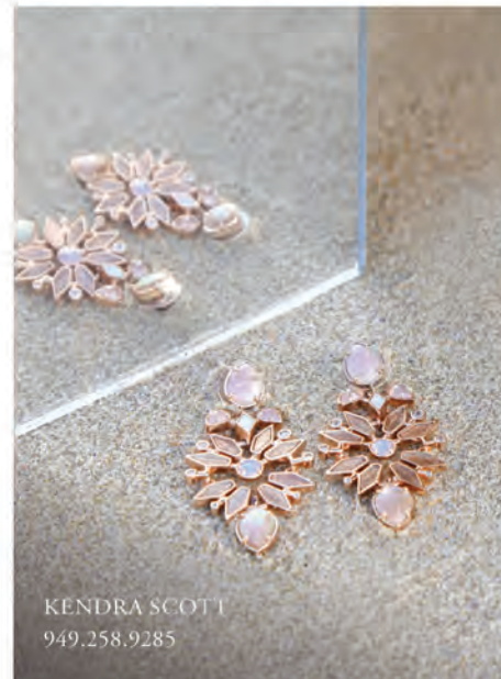
KENDRA SCOTT 949.258.9285