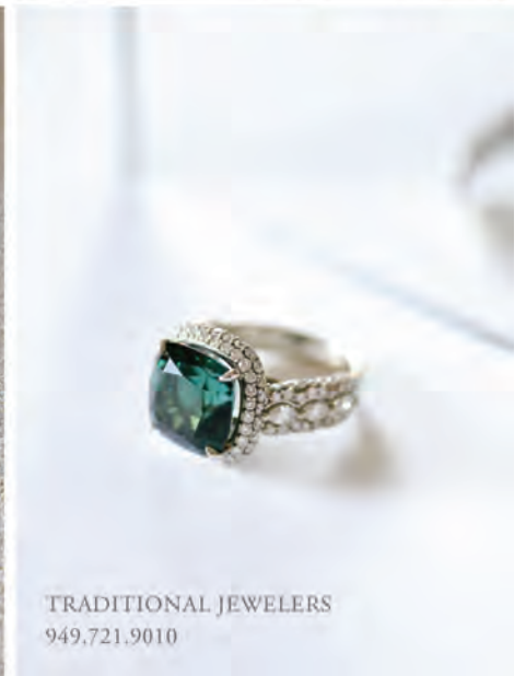
TRADITIONAL JEWELERS 949.721.9010