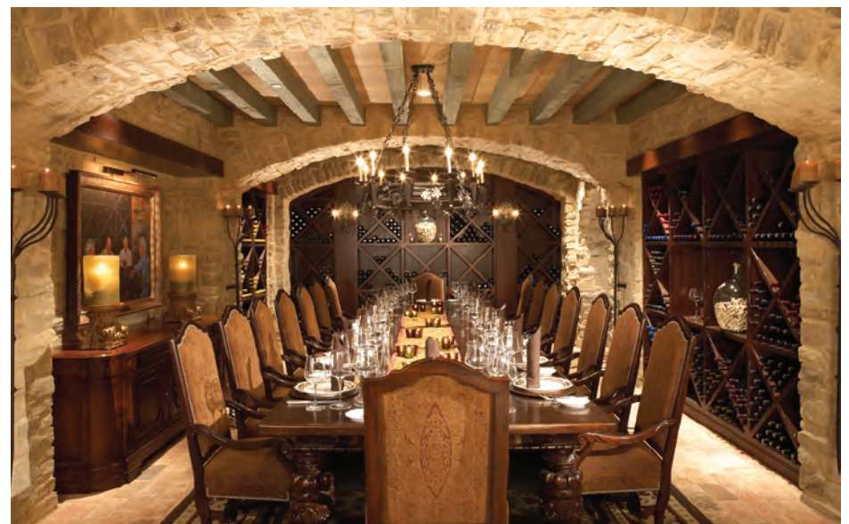
Toscana Country Club, Indian Wells, Wine Cellar

Fine restaurants, luxury spas, fitness studios and high-end residential all require subtle, refined details and consideration of space, lighting, acoustics, finishes, exterior appeal, interior design and landscape to create an environment that aligns with the purpose and vision of the project. The smallest details matter and it takes an experienced, skilled team to masterfully fuse great design with functionality and purpose. These are ultimately the venues that people talk about, share and continue to come back to.