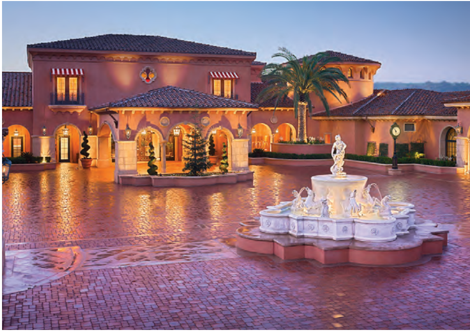
The Fairmont Grand Del Mar, Arrival Court