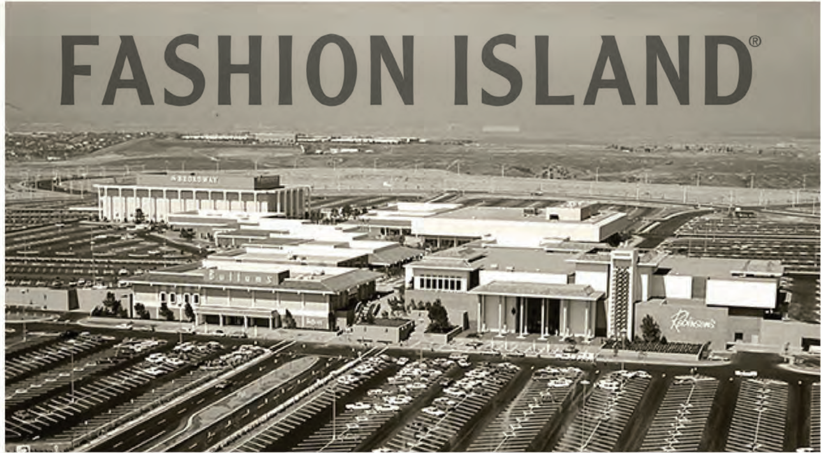
Fashion Island, 1967

As Fashion Island celebrates its 50th birthday, we're proud to play a key role in making it look its best at all times.