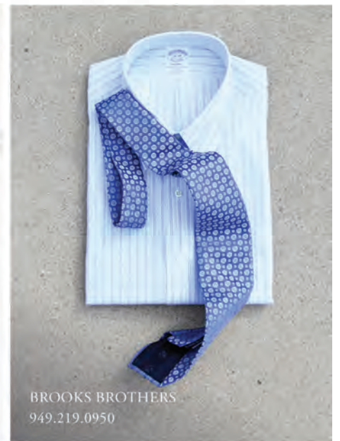
BROOKS BROTHERS 949.219.0950