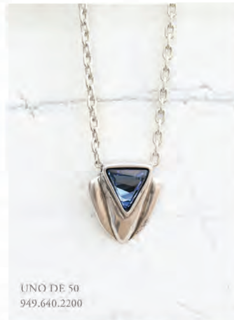
UNO DE 50 949.640.2200