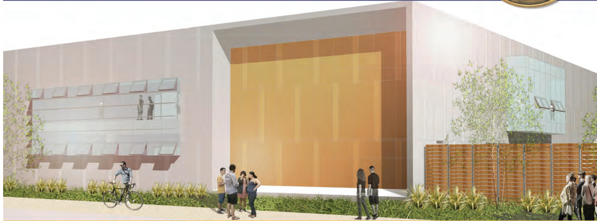
ARNOLD SHAPIRO ARTS & TECHNOLOGY CENTER | Middle & Upper School