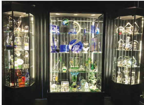
Crystal Room at Tustin Awards

Tustin Awards Inc. is open 8:30 a.m. to 5 p.m., Monday through Friday, and is conveniently located at 1322 Bell Ave., Suite 1-A in Tustin. For more information, call 714.247.2277 or visit tustinawards.com !