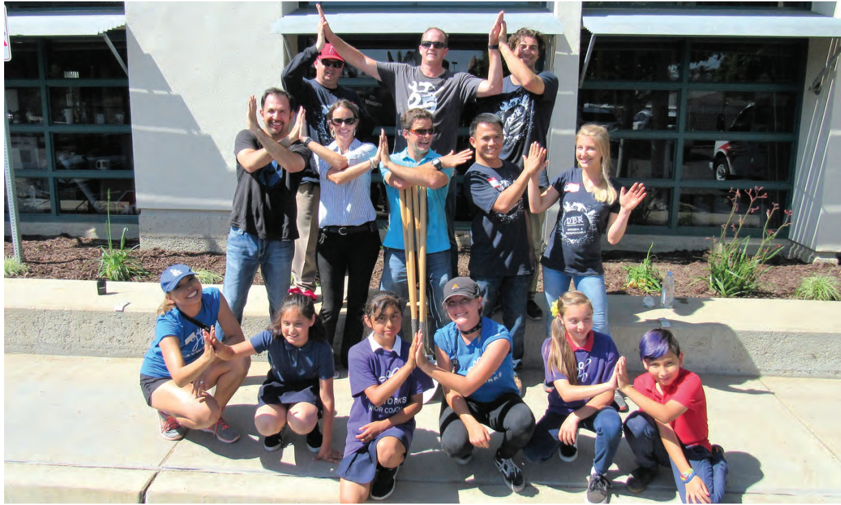
As part of Playworks Recess and Beautification projects, DPR team members spent the day with kids at MLK Elementary School in Santa Ana playing and planting new foliage at the front entrance of the school.