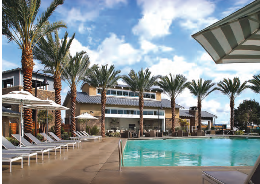
CalAtlantic's Greenwood in Tustin Legacy incorporates Tustin's history throughout the community.

Recently, CalAtlantic had the opportunity to partner with the City of Tustin to create Greenwood in Tustin Legacy, a single-family home community with four unique neighborhoods situated on the site of the former Tustin Marine Corps Air Station. The base is an iconic part of Tustin's history. Paying homage to that history, the City applied a thoughtful approach throughout the community design process. Think how fitting this idea is when you consider that Tustin Legacy, when