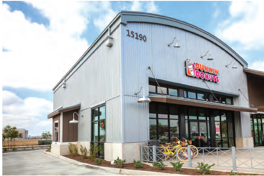
Dunkin' Donuts, now open at Tustin Legacy

With its architectural nod to farmhouse style, The Village at Tustin Legacy is the ideal setting for an outdoor event. The Village features anchors such as Stater Bros. Market, CVS and Bank of America. The wide variety of food and beverage options—including Chipotle Mexican Grill, Dunkin Donuts, Yogurtland, The Pizza Press, Burger Boss, Ahipoki Bowl, and Board and Brew—will be showcased throughout the Grand Opening & Fall Festival.