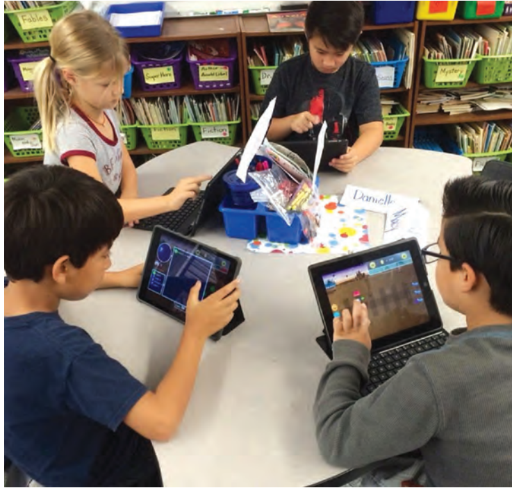
TUSD elementary students work on their iPads as instructional technology has transformed the classroom over the years.

The District also continues to make progress in student achievement in STEAM fields. This year, the District had two elementary schools, one middle school, and four high school robotics teams compete in the VEX World Robotics Championships. The schools representing the District were Orchard Hills School, and Beckman and Foothill high schools. Tustin High