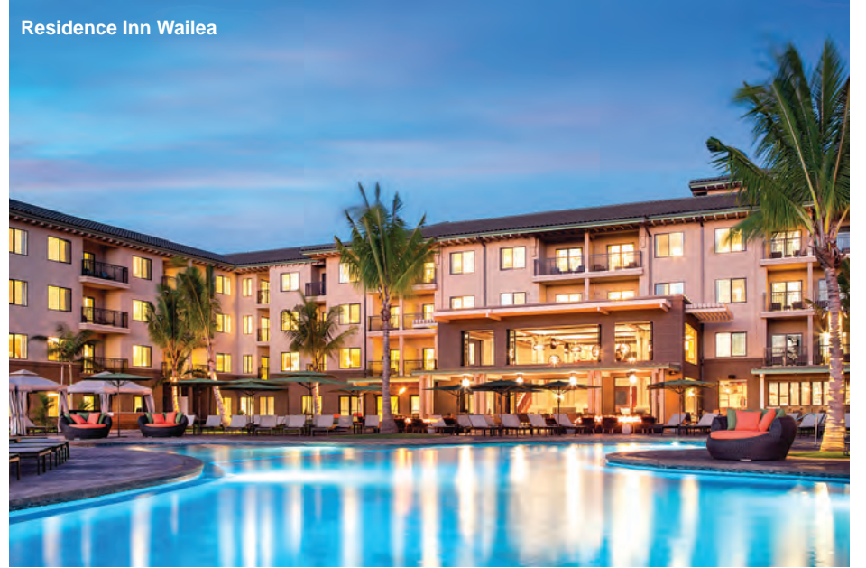
Residence Inn Wailea