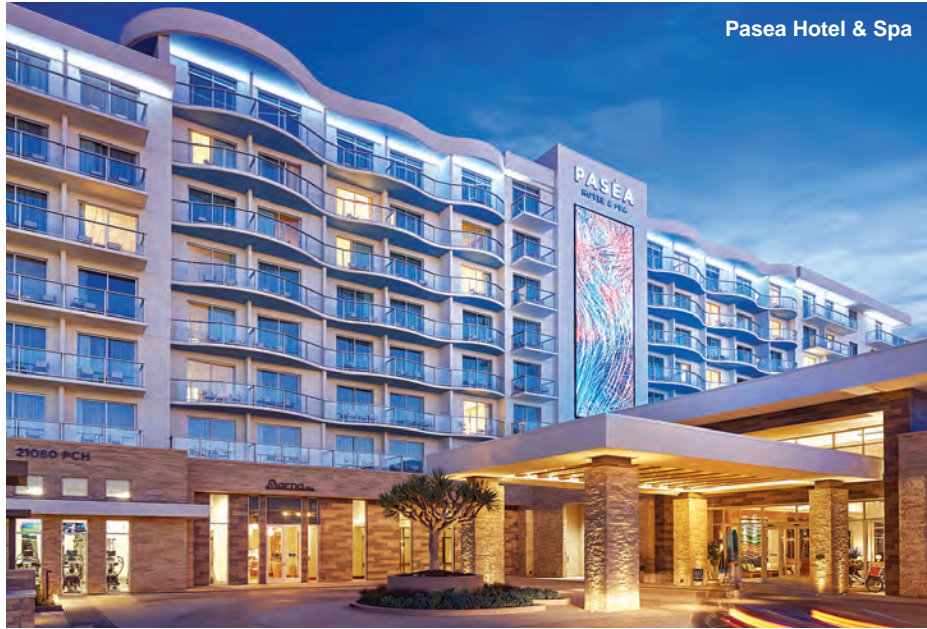
Pasea Hotel & Spa