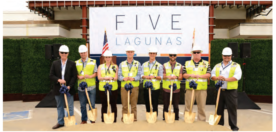
C.W. Driver recently broke ground on Five LAGUNAS Center Redevelopment Project in Laguna Hills, California. Redevelopment will enhance the property's aesthetics to create a promenade-style urban village.