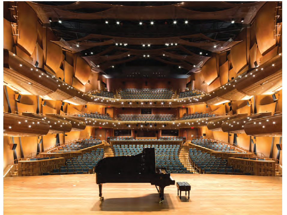
Musco Center for the Arts