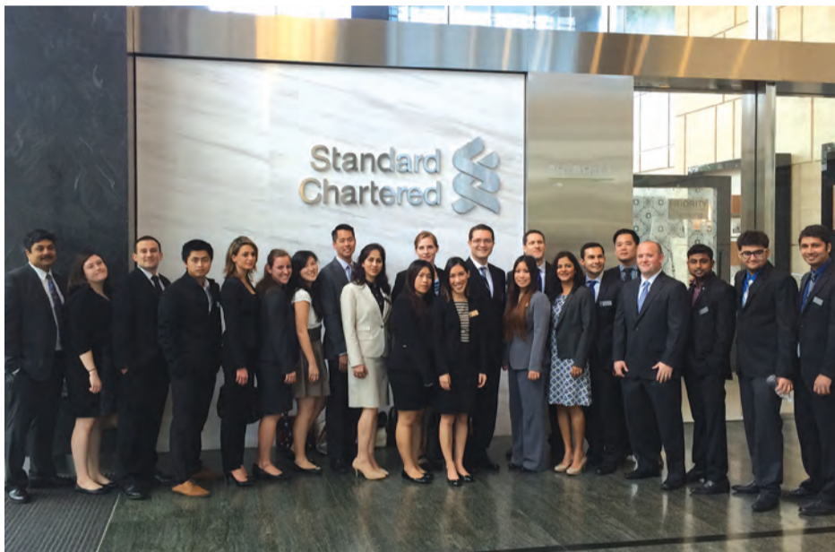
International corporate site visits provide Mihaylo graduate students with an inside look at global business.

Mihaylo College is positioned in the heart of Southern California’s vibrant business and research district. The college fuels the economic and corporate success of this region by instilling in its graduates a strong core business knowledge, critical thinking skills and motivation, thereby