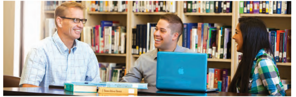
Vanguard believes learning goes beyond the classroom and happens in the context of relationships with faculty and other students.

Vanguard's faculty is simply outstanding. Our professors advise U.S. presidents, win national theater awards, pioneer scientific research in China, perform at Carnegie Hall and the Hollywood Bowl, and much more. Seventy percent of our professors hold doctorates in their field from some of the most prestigious universities in the world.