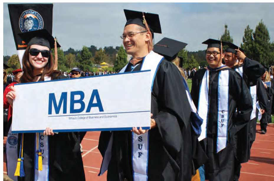
MBA program graduates recognized for degree completion at commencement.

Mihaylo is a preferred recruiting school for the Big Four and the regional accounting firms in the Los Angeles and Orange County areas. Excelling in