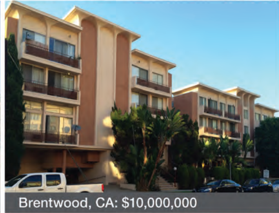
Brentwood, CA: $10,000,000