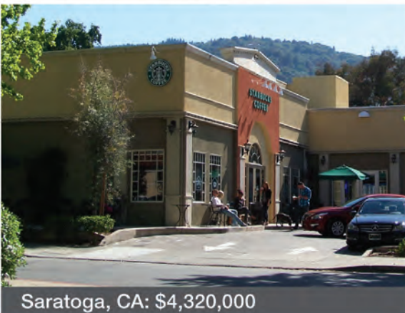
Saratoga, CA: $4,320,000