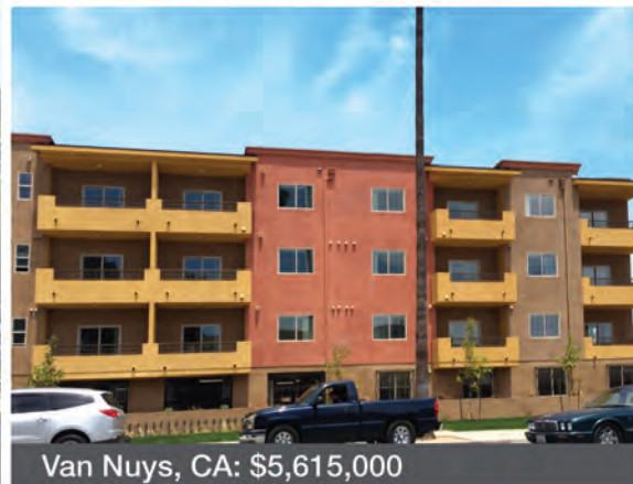
Van Nuys, CA: $5,615,000