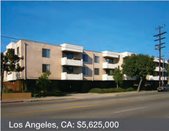
Los Angeles, CA: $5,625,000