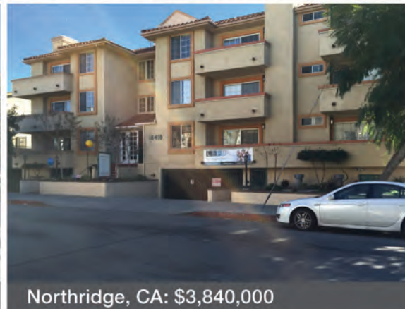
Northridge, CA: $3,840,000