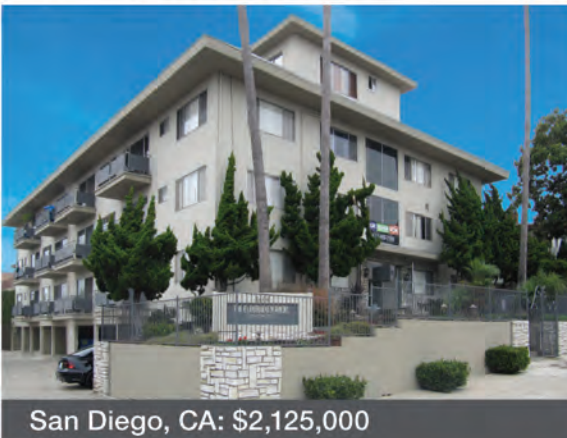
San Diego, CA: $2,125,000