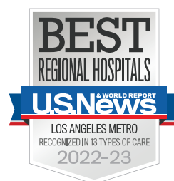
St. Jude Medical Center