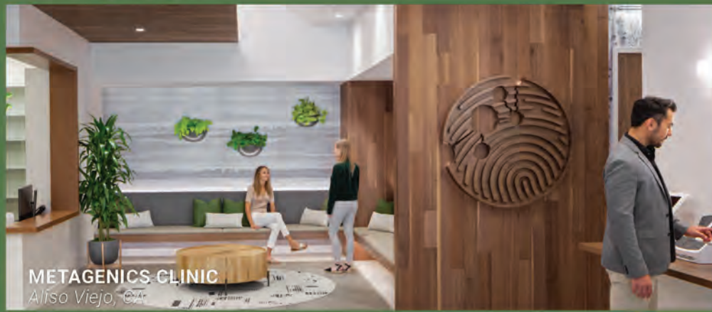
METAGENICS CLINIC Aliso Viejo, CA