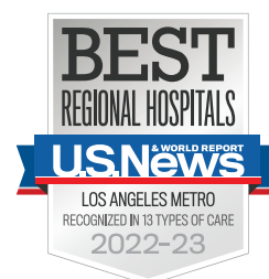
Little Company of Mary Torrance