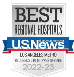
Mission Hospital Mission Viejo and Laguna Beach