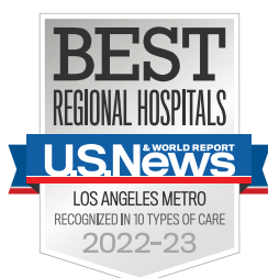
Providence Cedars-Sinai Tarzana Medical Center