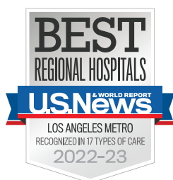
Saint John's Health Center