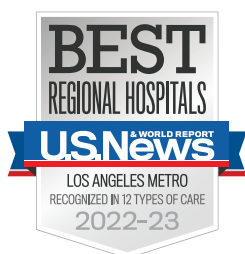
Saint Joseph Medical Center Burbank