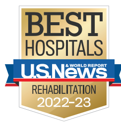
Little Company of Mary San Pedro