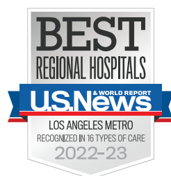
St. Joseph Hospital Orange