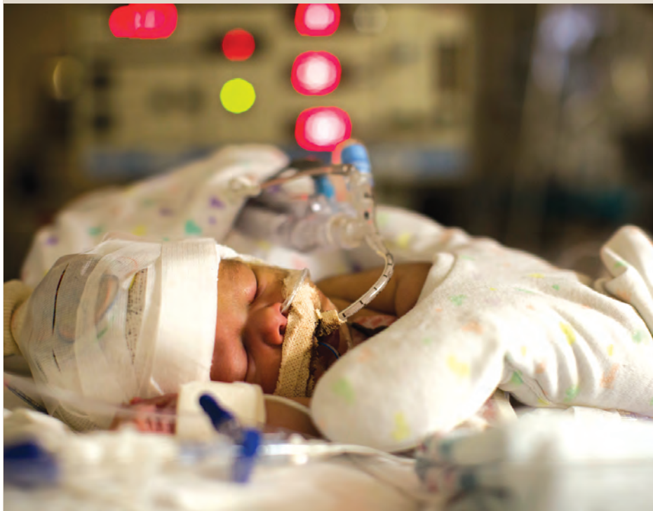
Special equipment, including long-term video EEG monitoring and a whole body cooling system, are available in the CHOC NICU to protect a baby's brain.