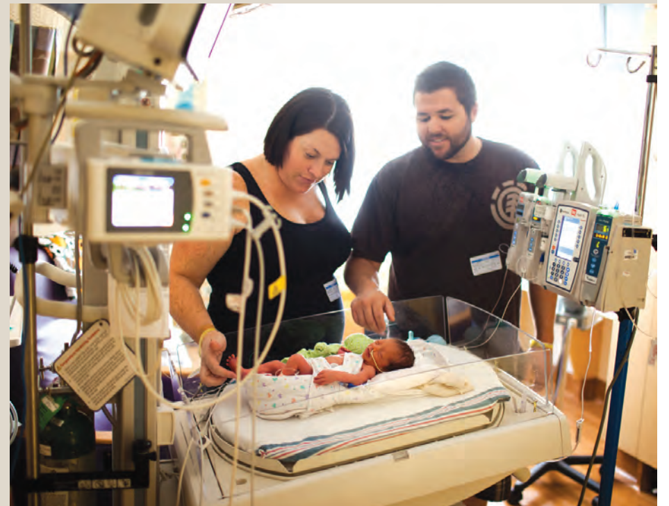
Families are an important part of the NICU care team at CHOC. They are encouraged to participate in discussions with physicians and nurses, as well as spend as much time with their baby as possible.

Babies on this unit lie inside shrouded incubators that keep light away from their underdeveloped eyes. Even a whisper is harsh for these babies' ears, so families and staff members speak in a gentle "library voice." The goal is to mimic the womb's environment as closely as possible so that infants can focus on growing.