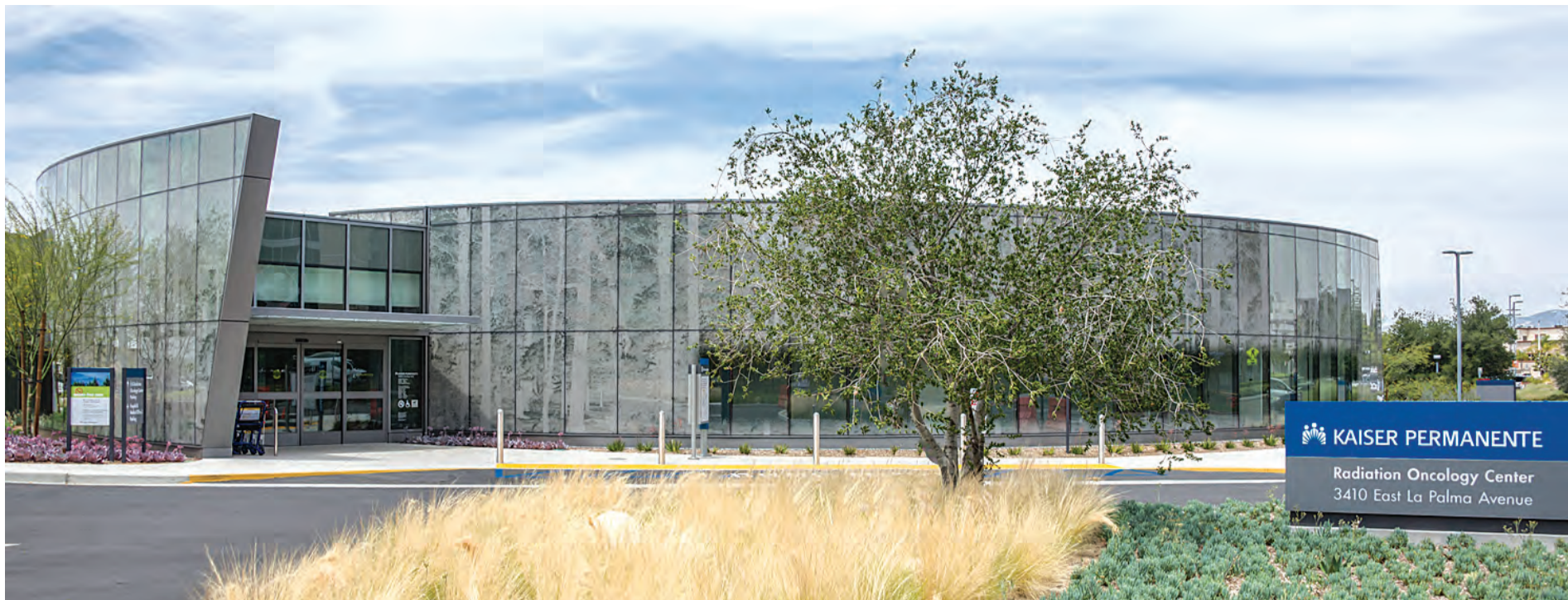
Radiation Oncology Center