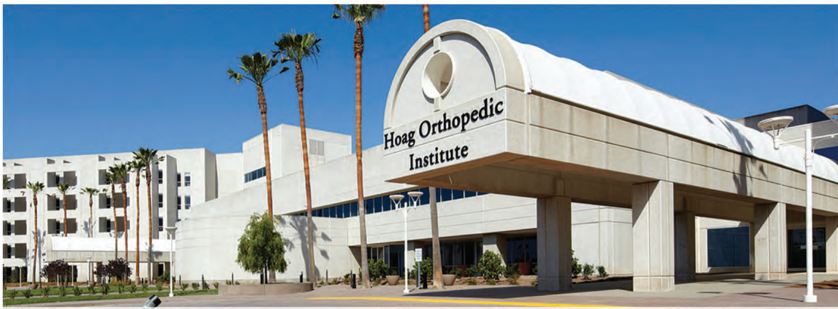
Hoag Orthopedic Institute, Irvine