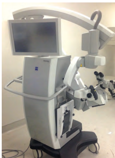
An "Opmi Pentero 900," a half million dollar HD microscope used by surgeons at Orange County Global Medical Center to visualize tissue structures and blood vessels in microsurgical applications.

For more than 40 years, Anaheim Global Medical Center (AGMC), the nearest Emergency Department to the Disneyland and Anaheim resort area, has delivered innovative and advanced medical care to the Orange County community. Its 189-licensed bed facility provides a variety of healthcare services including Emergency and Critical Care; Maternal Child Health Delivery Land program; and its advanced Cardiology Department, led by one of the top cardiothoracic surgeons in the United States. In fact, Anaheim Global Medical Center is a 2015 Healthgrades award recipient for Coronary Bypass Surgery and Coronary Intervention. Anaheim Global Medical Center is also accredited as a STEMI Receiving Center for its coordinated systems of care, and capability of properly treating an ST-elevation myocardial