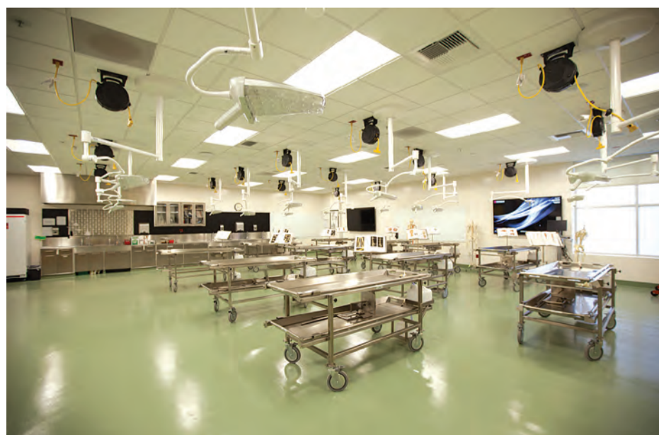
The anatomy lab integrates technology with traditional cadaver dissection in order to better train students.