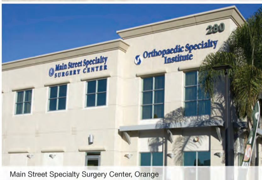
Main Street Specialty Surgery Center, Orange