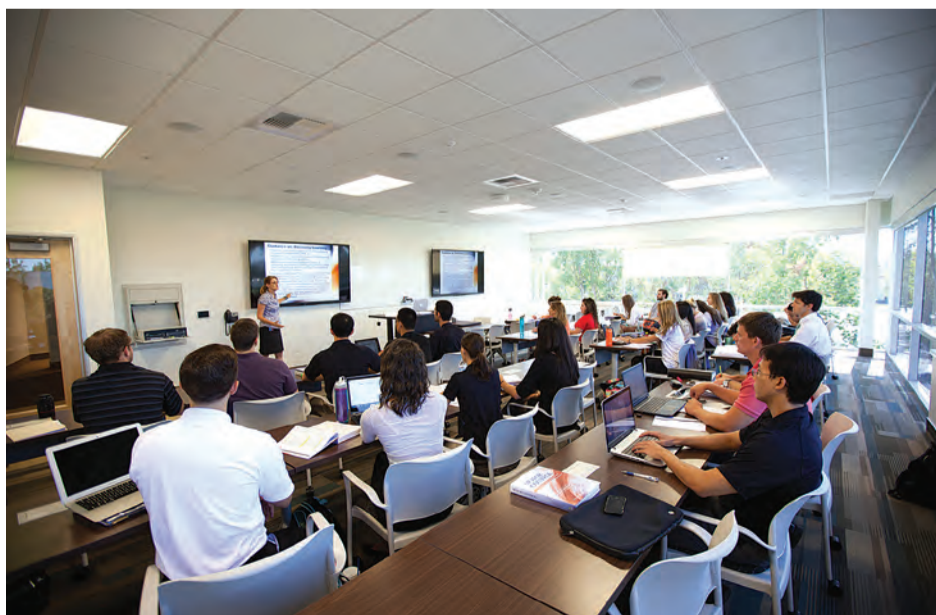
Flexible, shared classroom spaces provide students with opportunities for inter-professional collaboration.

Rinker Health Science Campus 9401 Jeronimo Rd. Irvine, CA 92618 chapman.edu