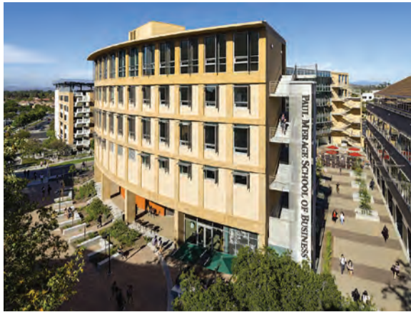
The UCI Paul Merage School of Business Campus