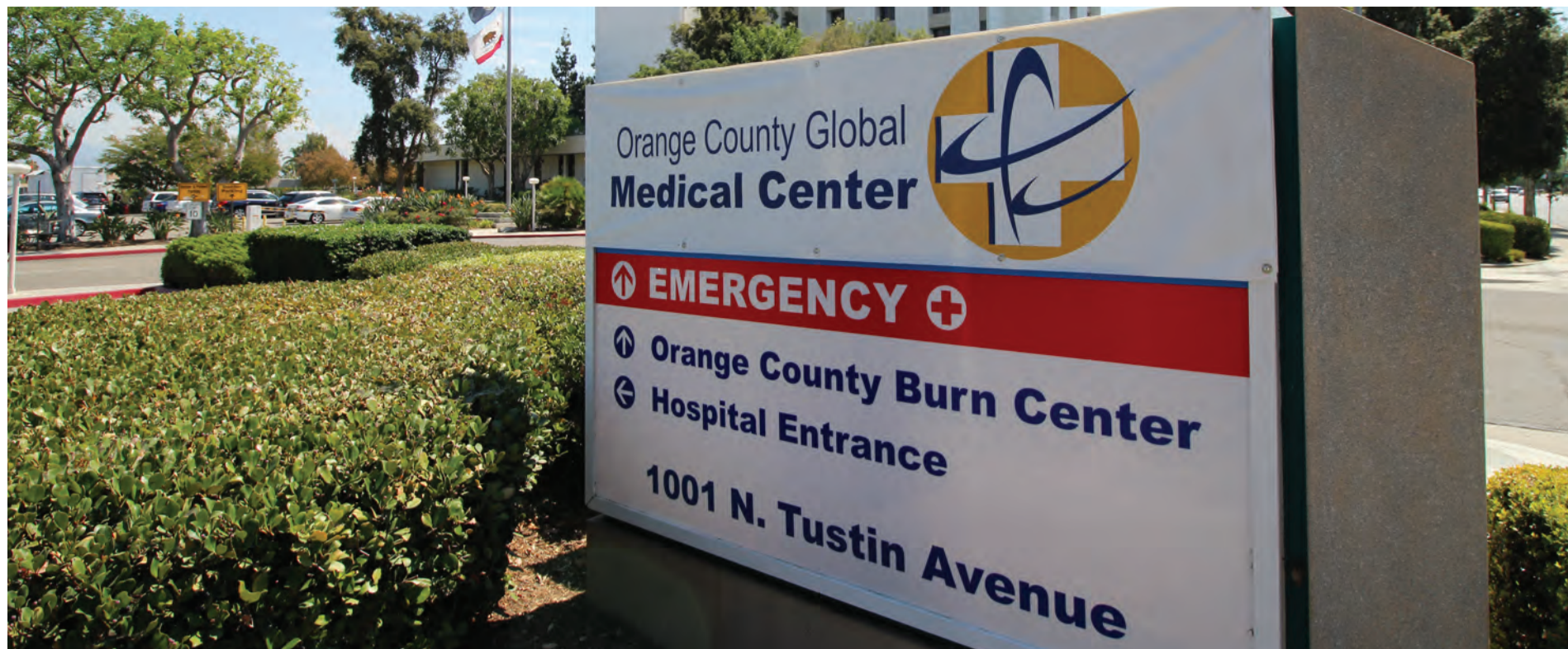
Orange County Global Medical Center, our flagship hospital and one of only two Level II Trauma Centers in the county.