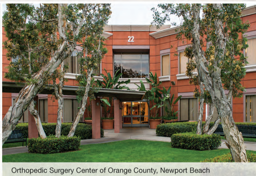
Orthopedic Surgery Center of Orange County, Newport Beach