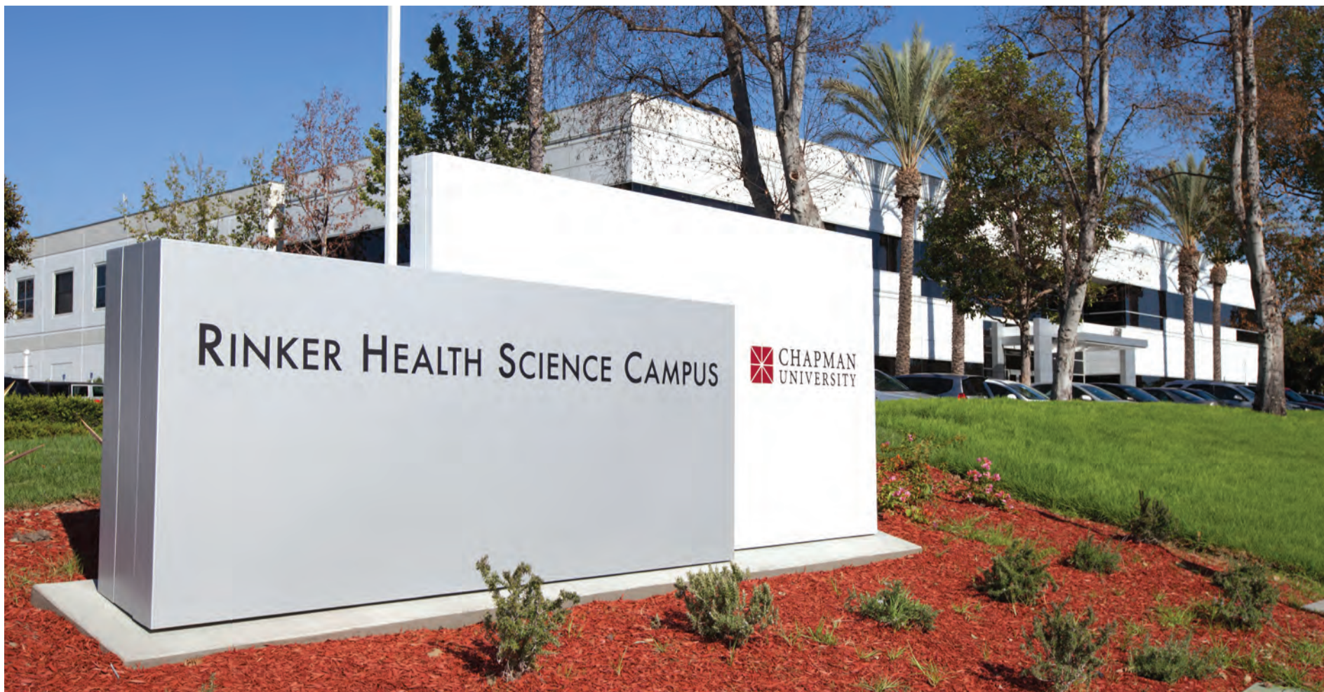
The Rinker Health Science campus comprises 7.5 acres of technologically innovative space.