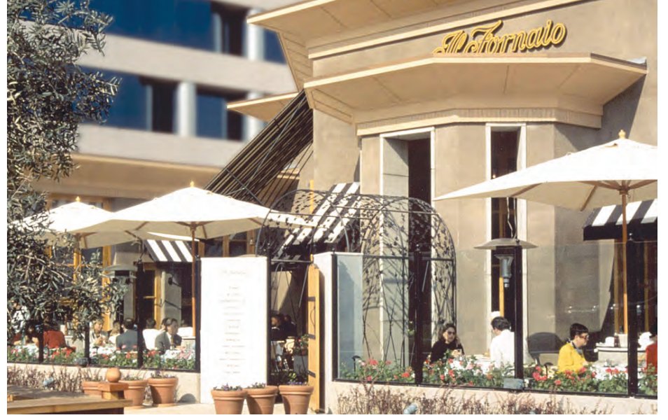
Il Fornaio aspires to bring its guests closer to Italy with each visit to the restaurant.