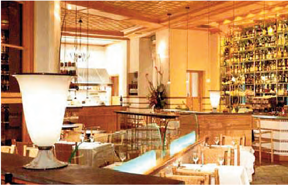
Enjoy authentic cuisine paired with regional wines at Il Fornaio.