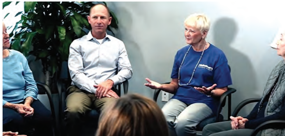
Alzheimer's Orange County's 45 caregiver support groups are just one of its many no-cost services and programs to help those in OC affected by Alzheimer's and dementia.

Calling Alzheimer's an epidemic is not an exaggeration. More than 5.4 million Americans today are living with Alzheimer's disease or another form of dementia, and studies show that around 84,000 people are affected right here in Orange County. As the fourth leading cause of death in Orange County, Alzheimer's inflicts devastating physical, emotional and financial burdens on those it affects and their loved ones. Because there is no way to prevent, treat or cure the disease, the impact of Alzheimer's will only grow worse.