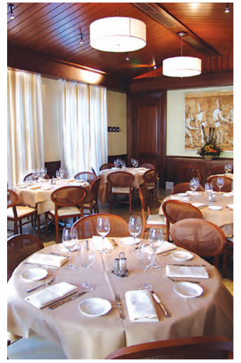
Canaletto is located in Newport Beach's Fashion Island.