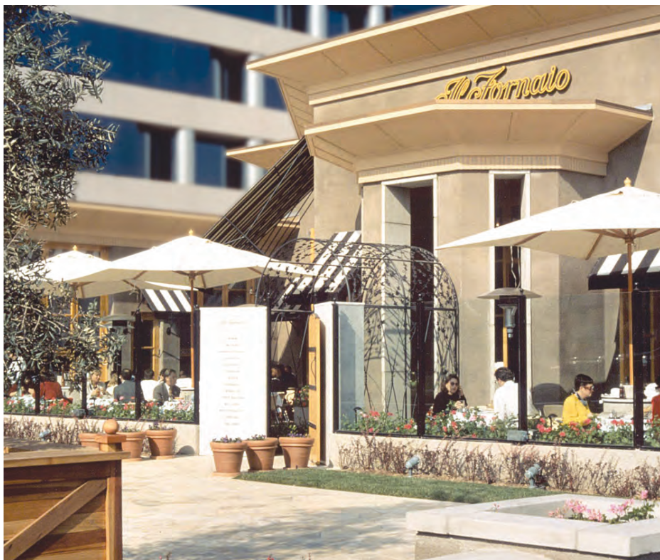
Il Fornaio aspires to bring its guests closer to Italy with each visit to the restaurant.