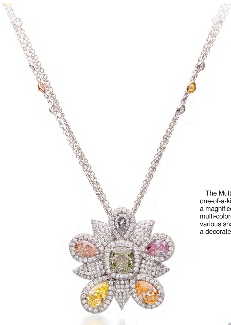
The Multi-Color Diamond Pendant is another one-of-a-kind Lugano Diamonds piece featuring a magnificent display of nearly 6 carats of mixed multi-colored and round brilliant diamonds in various shapes, sizes and cuts, suspended from a decorated, double platinum chain.

An exclusive collection of exceptional gemstones has made Lugano Diamonds a renowned resource for rare gems and custom designs, with beauty and artistic craftsmanship apparent in every signature piece. The Pink Diamond Flower Ring and the Pink and White Diamond Earrings, both showcasing the highly-desirable fancy pink diamond at their center, are reflective of Lugano's unparalleled dedication to fulfilling every guest's dream design.