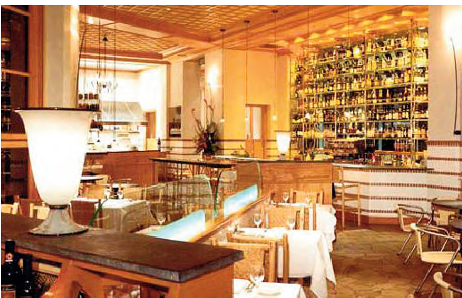
Enjoy authentic cuisine paired with regional wines at Il Fornaio.

Il Fornaio is located at 18051 Von Karman Avenue in Irvine. For reservations, please call 949.261.1444 or learn more about Il Fornaio at www.ilfornaio.com .