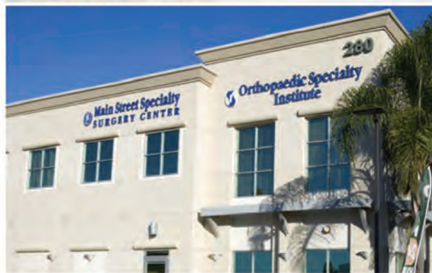
Main Street Specialty Surgery Center, Orange