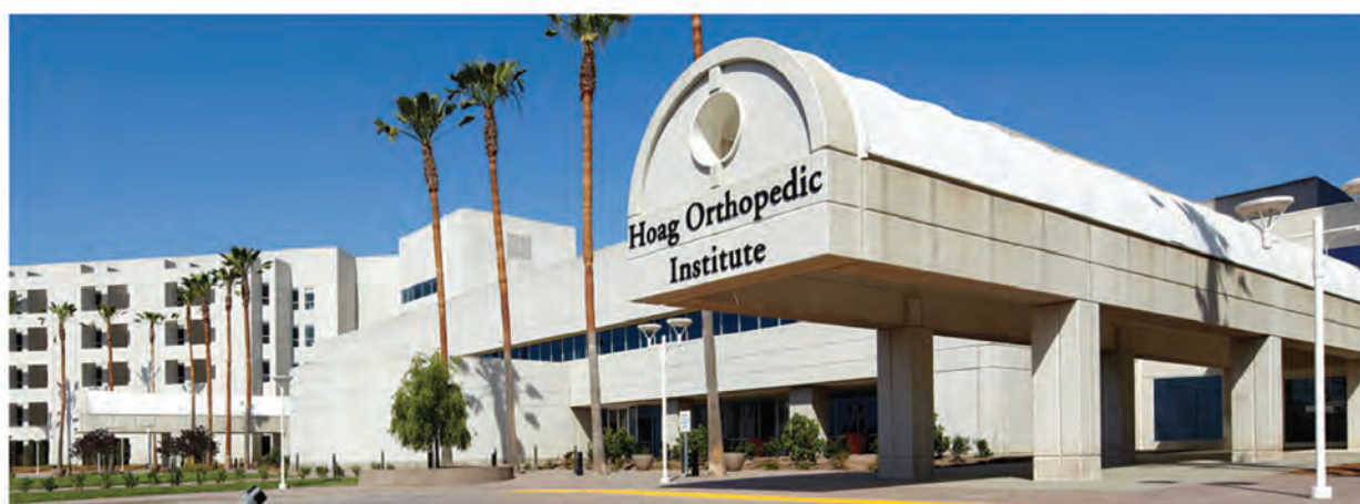
Hoag Orthopedic Institute, Irvine