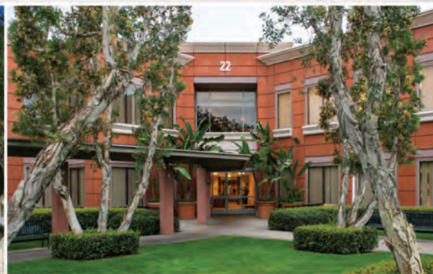
Orthopedic Surgery Center of Orange County, Newport Beach