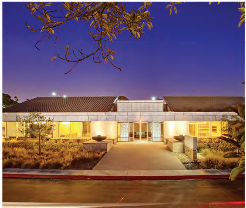
Class A office space near the Fashion Island regional shopping area. Space available to lease up to 4,000 sq ft contiguous. Opportunity for building signage.