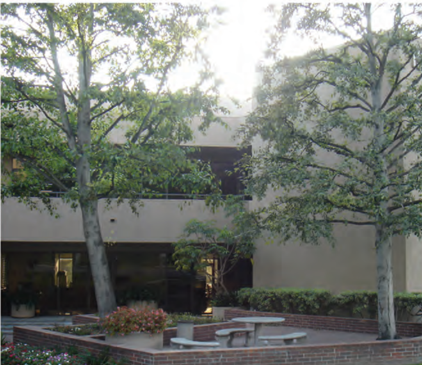
Professional office building in the heart of the Fashion Island Regional Shopping Area. Suites available to lease up to 5,500 sq ft contiguous. Owner/User opportunity with building signage.

1000 Newport Center Drive, Newport Beach, CA Available for Lease | $4.75 FSG