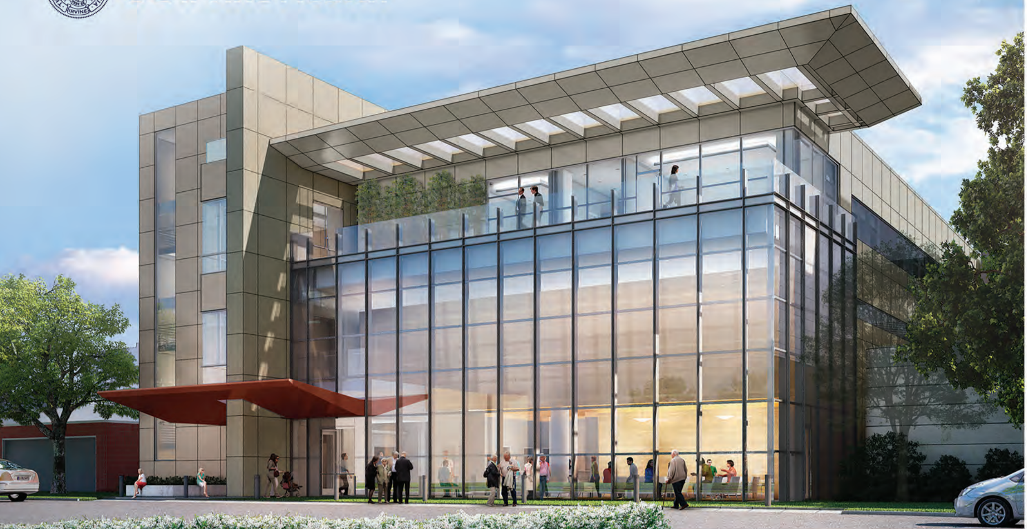
H.H. Chao Comprehensive Digestive Disease Center