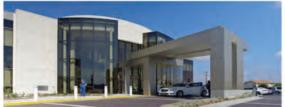
Orange Coast Memorial Health & Wellness Pavilion, Fountain Valley.