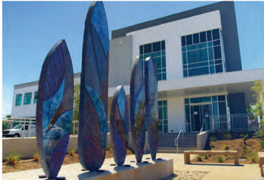
Huntington Beach Health Center, Beach Boulevard.

Opening in May and conveniently located on Beach Boulevard in Huntington Beach, MemorialCare's newest health center includes primary care, pediatrics, sports medicine, advanced imaging, dialysis services, occupational medicine and a lab draw station.