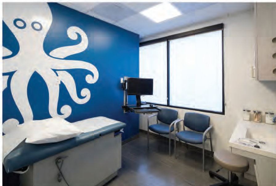
Children's Specialty Center in Irvine.