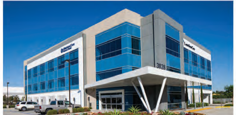
Douglas Park Health Center, Long Beach.