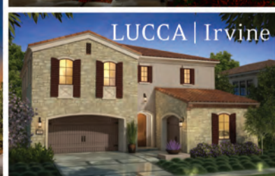
LUCCA | Irvine