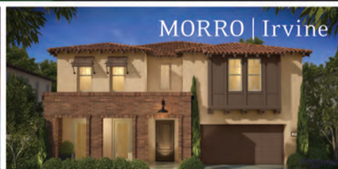
MORRO | Irvine