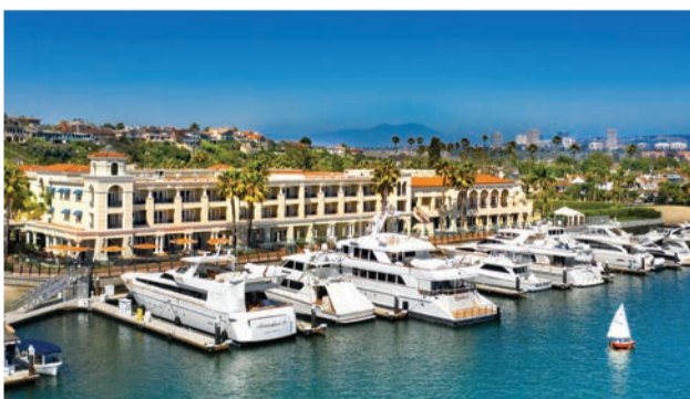
BALBOA BAY RESORT & CLUB