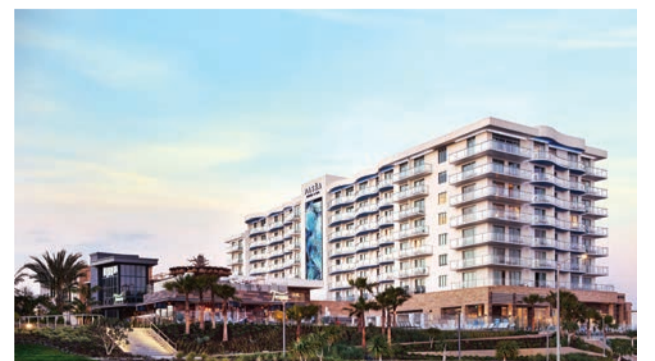
PASEA HOTEL & SPA

HOSPITALITY | GOLF | LIFESTYLE RESIDENTIAL | SPORTS ENTERTAINMENT