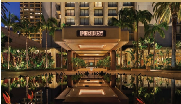
PENDRY NEWPORT BEACH