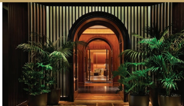
THE ELWOOD CLUB