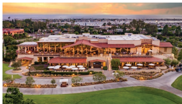
NEWPORT BEACH COUNTRY CLUB