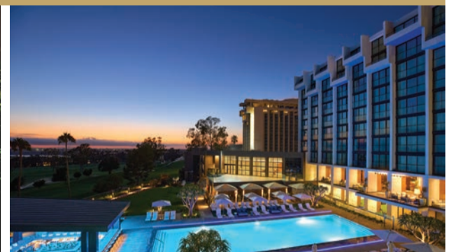
VEA NEWPORT BEACH