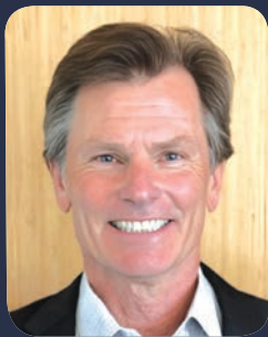
JIM ROSE CORE BROKERS