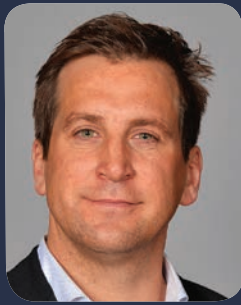
BARRON DORF ONEDIGITAL