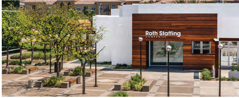
No. 2 Roth Staffing saw an increase in the AI and medical device manufacturing sectors

Staffing agencies said they placed 27,608 temporary workers at OC firms last year, up 2%