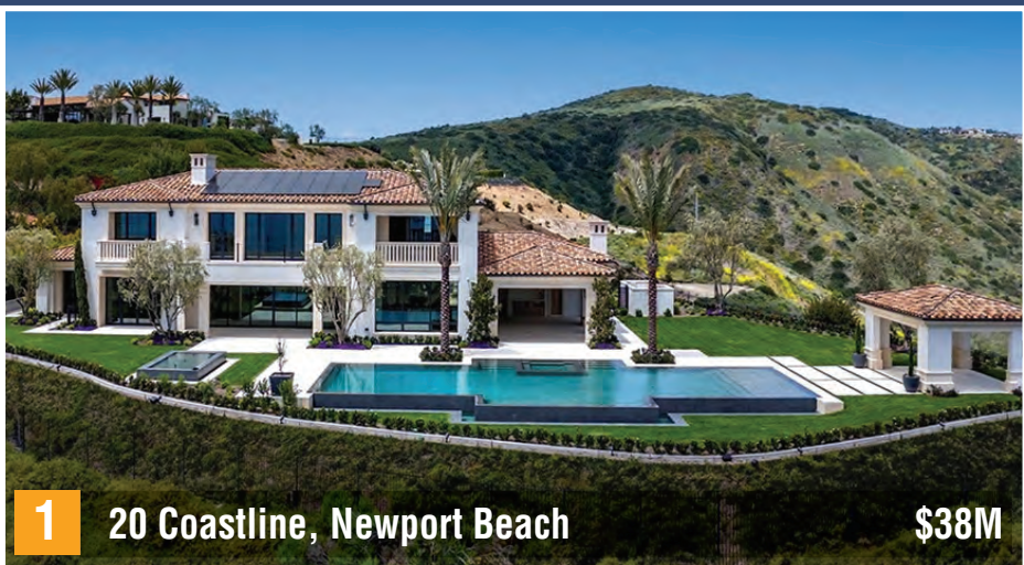
1 20 Coastline, Newport Beach $38M