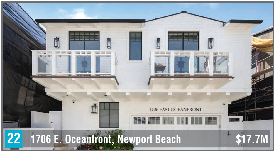
22 1706 E. Oceanfront, Newport Beach $17.7M