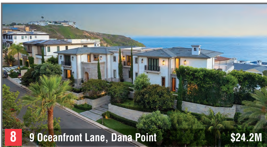
8 9 Oceanfront Lane, Dana Point $24.2M