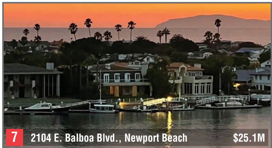
7 2104 E. Balboa Blvd., Newport Beach $25.1M