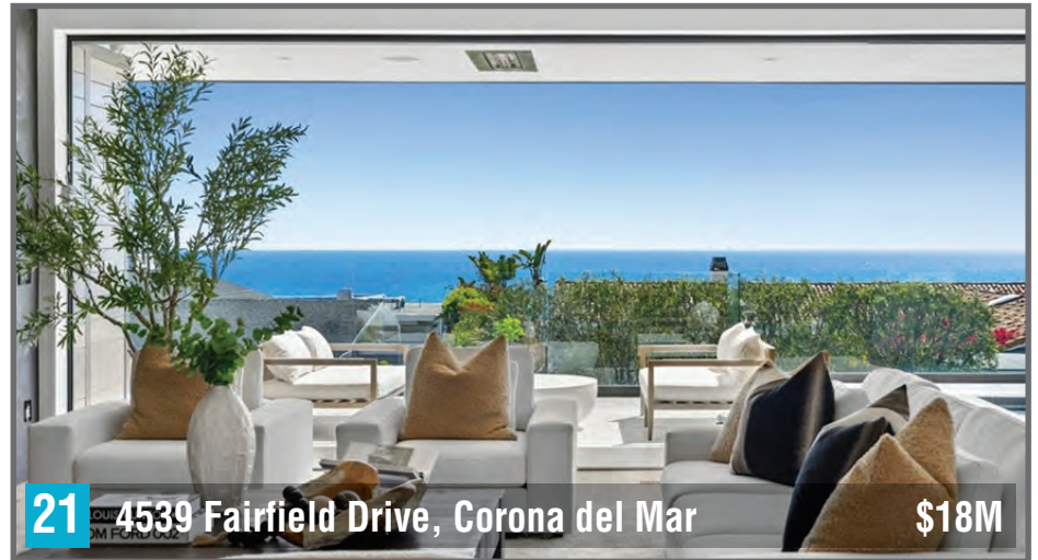
21 4539 Fairfield Drive, Corona del Mar $18M