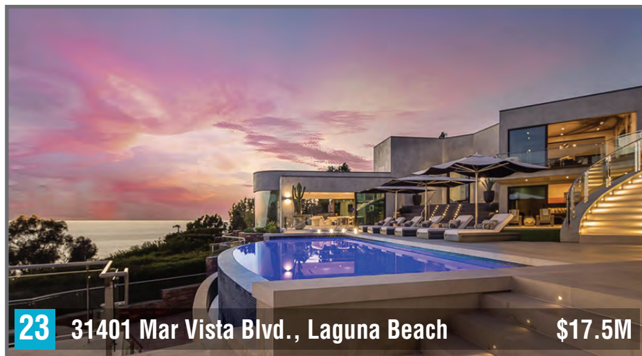
23 31401 Mar Vista Blvd., Laguna Beach $17.5M