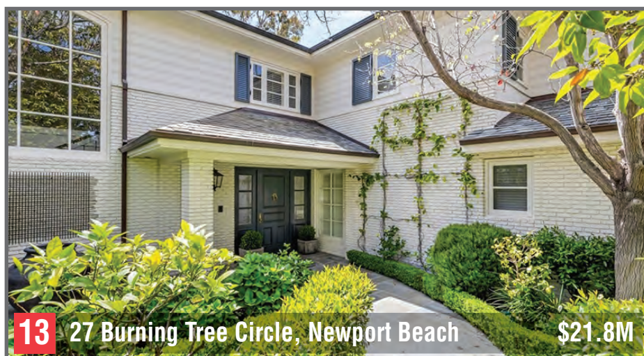
13 27 Burning Tree Circle, Newport Beach $21.8M

Closing Date: Sept. 12 Specs: 9,906 square feet, 6 beds/9 baths Lot Size: 0.64 acres Year Built: 2021 Seller: Simon Zhang, Mei Claire Yu Buyer: 70 Harmon LLC Agents: John Cain, Pacific Sotheby's International Realty