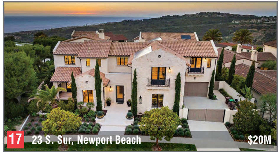
17 23 S. Sur, Newport Beach $20M