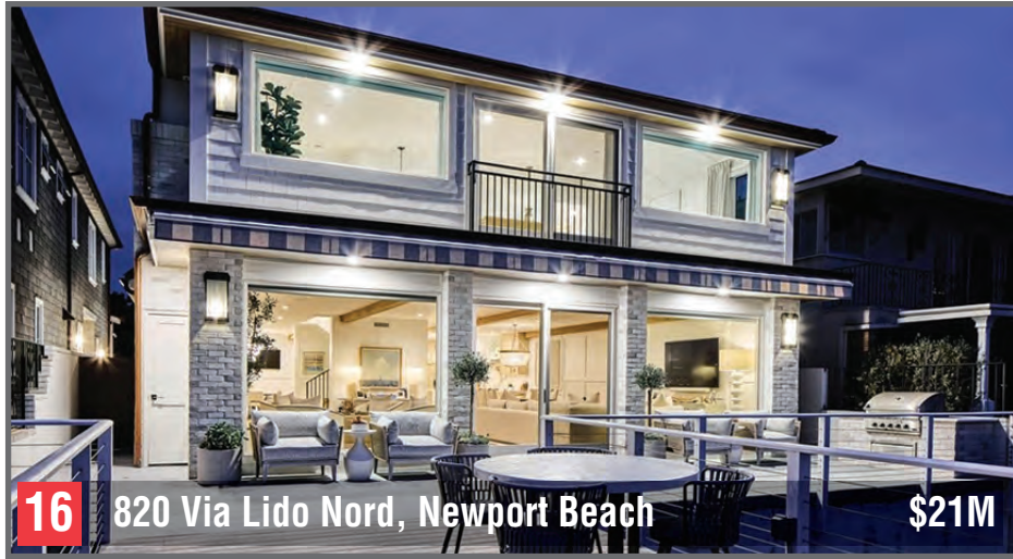
16 820 Via Lido Nord, Newport Beach $21M