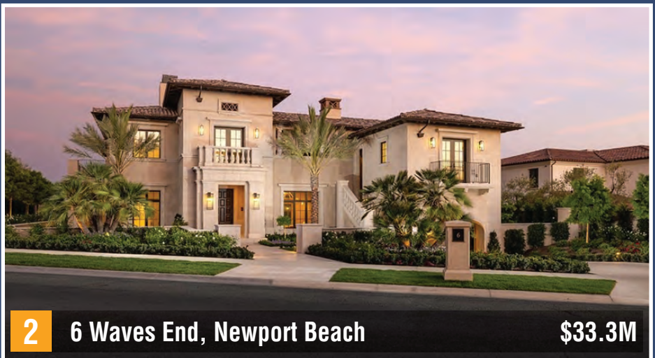
2 6 Waves End, Newport Beach $33.3M