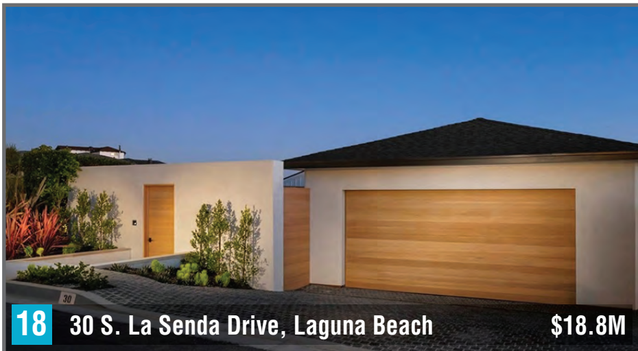
18 30 S. La Senda Drive, Laguna Beach $18.8M