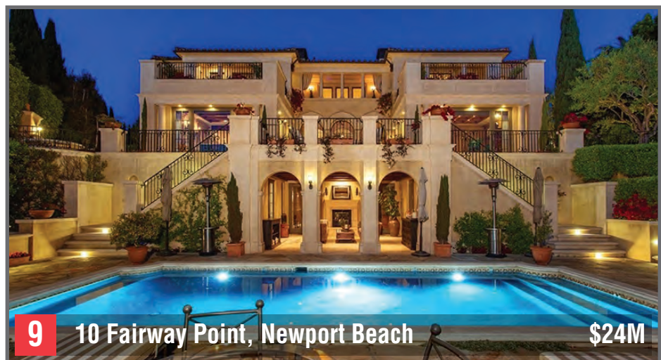
9 10 Fairway Point, Newport Beach $24M