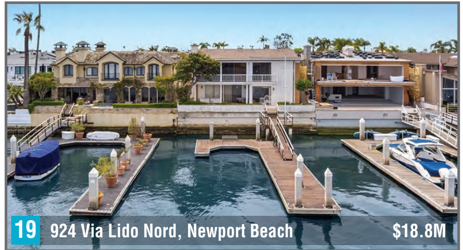
19 924 Via Lido Nord, Newport Beach $18.8M