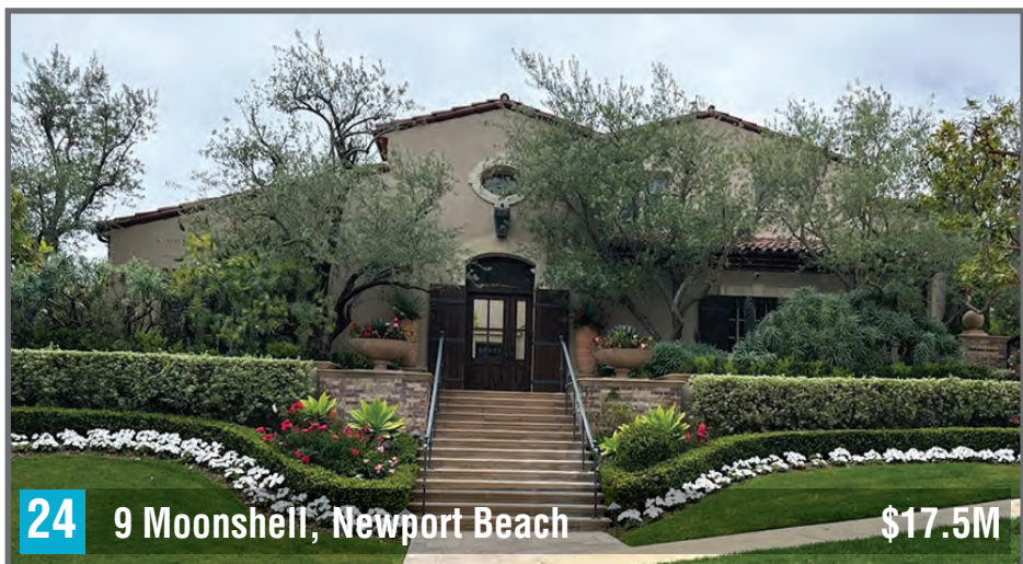
24 9 Moonshell, Newport Beach $17.5M

Closing Date: Dec. 26 Specs: 12,730 square feet, 5 beds/8 baths Lot Size: 11.89 acres Year Built: 2010 Seller: Spondoux Co. LLC Buyer: The Doctors Co. Agents: Ginger Glass, Compass; Shala Emdadi, Realty One Group West