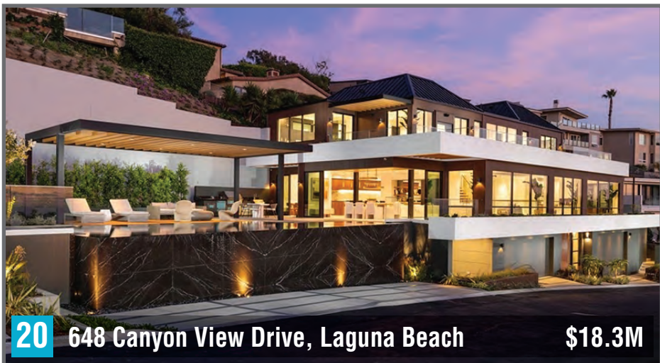
20 648 Canyon View Drive, Laguna Beach $18.3M