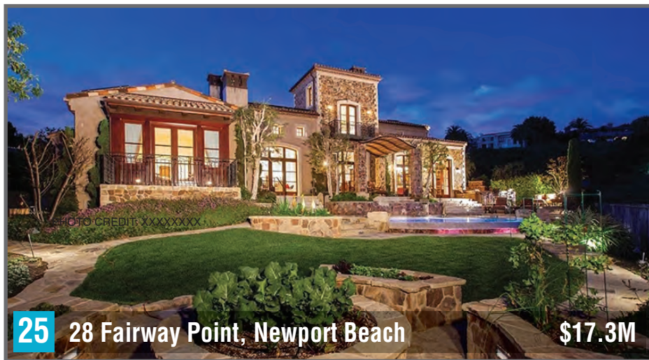
25 28 Fairway Point, Newport Beach $17.3M