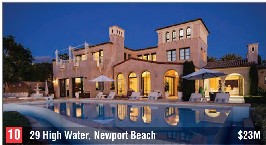
10 29 High Water, Newport Beach $23M