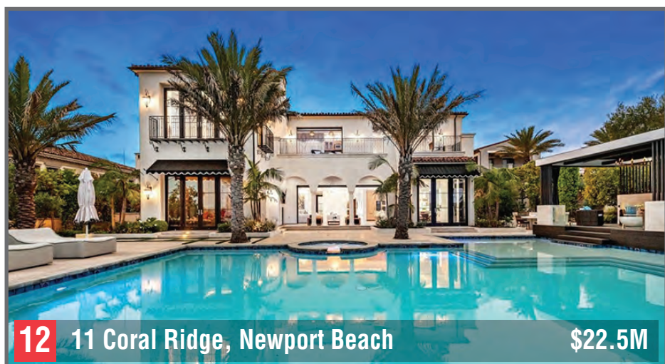
12 11 Coral Ridge, Newport Beach $22.5M