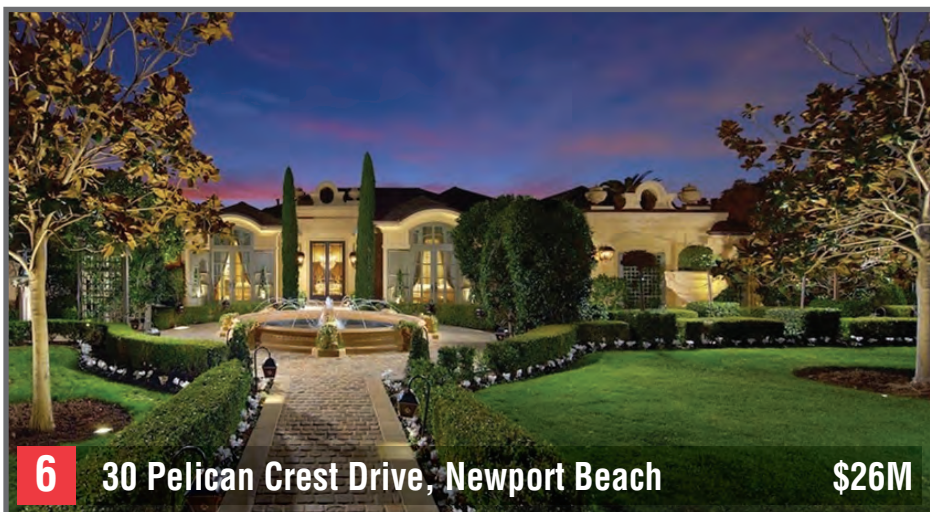
6 30 Pelican Crest Drive, Newport Beach $26M