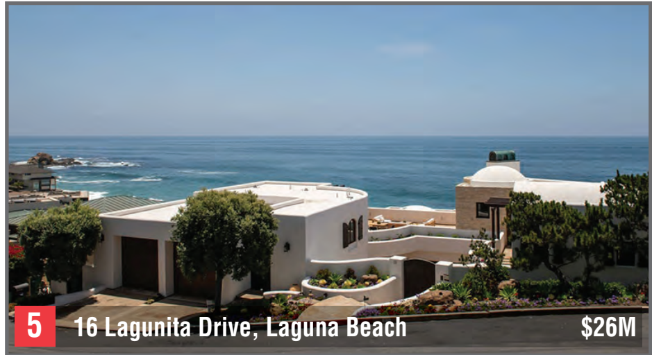
5 16 Lagunita Drive, Laguna Beach $26M