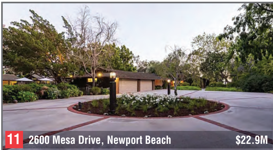
11 2600 Mesa Drive, Newport Beach $22.9M