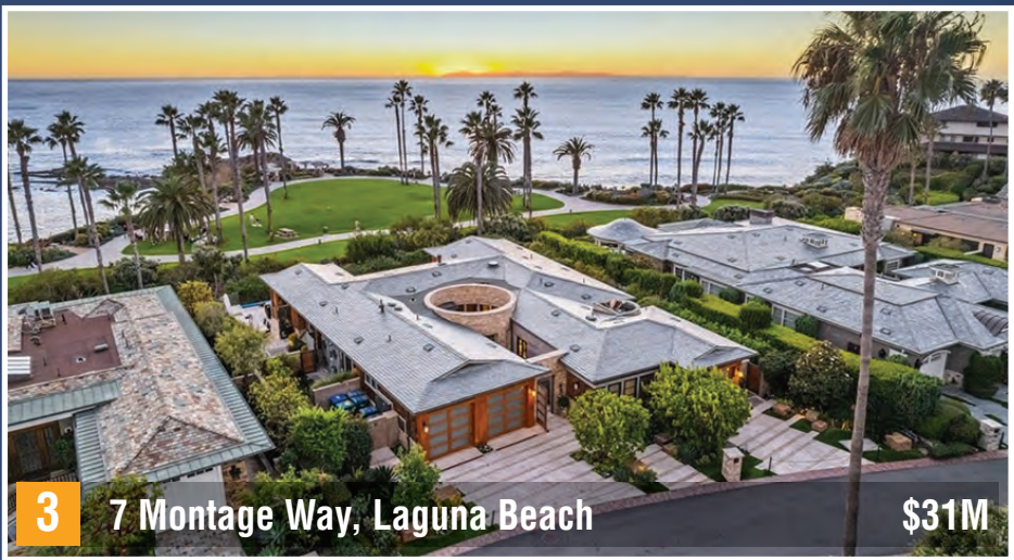
3 7 Montage Way, Laguna Beach $31M