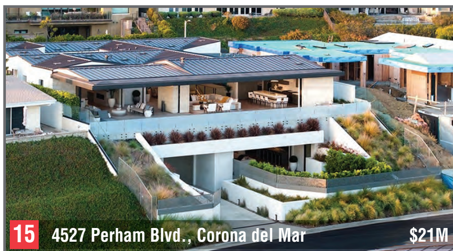
15 4527 Perham Blvd., Corona del Mar $21M