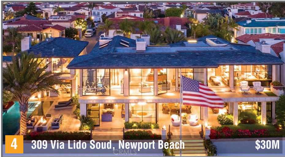
4 309 Via Lido Soud, Newport Beach $30M