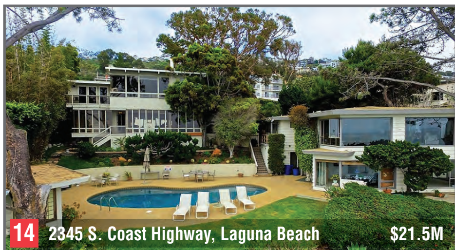
14 2345 S. Coast Highway, Laguna Beach $21.5M