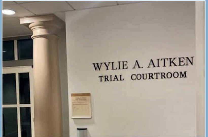
Wylie A. Aitken Trial Courtroom.