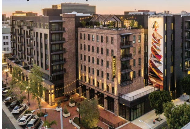
Rafferty Mixed-Use Development

Manufacturing, Healthcare & Social Services, Retail Trade, Food & Beverage, Hospitality, Government, Education, Public Services, Arts & Culture