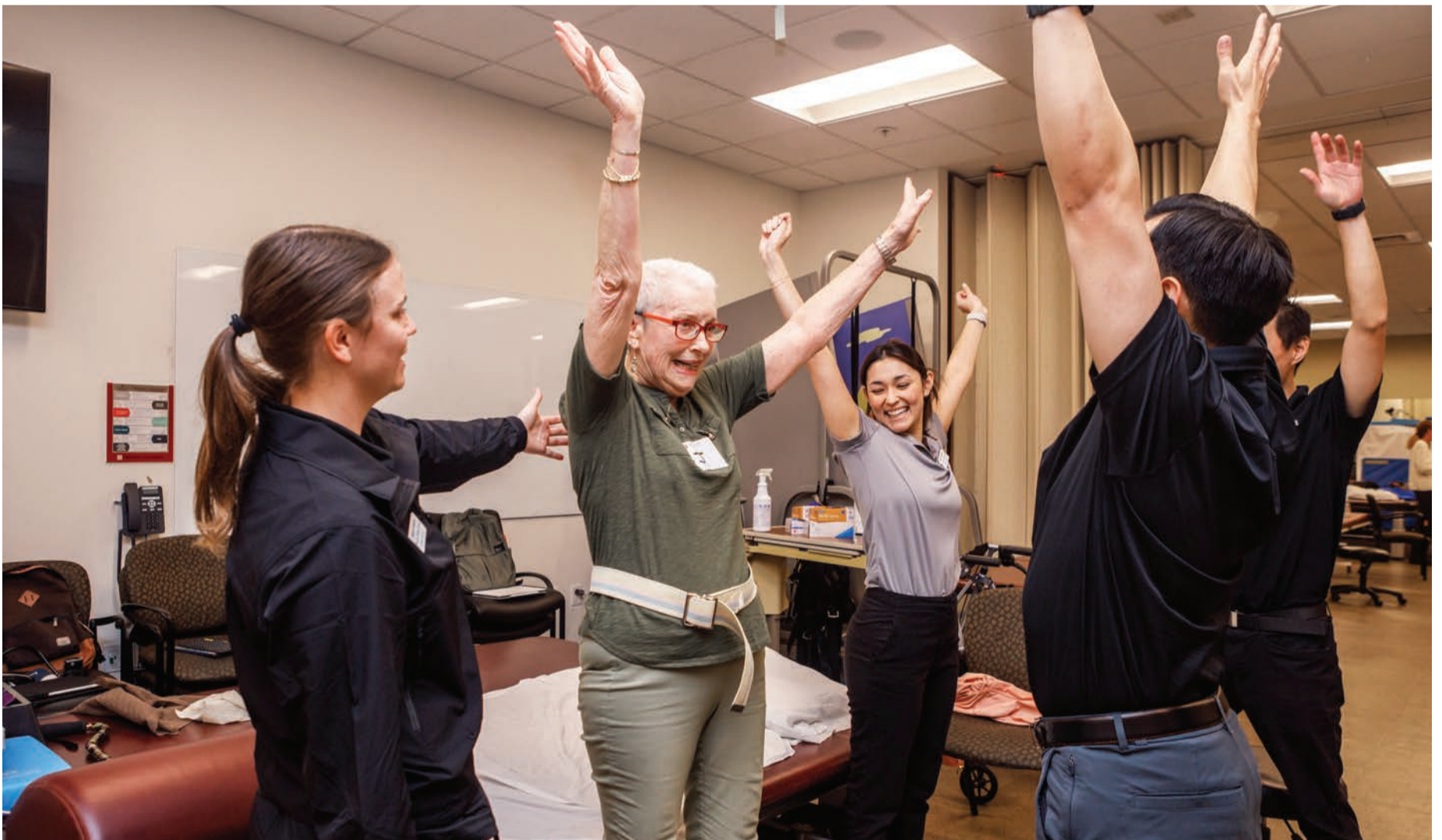
At Crean College's Stroke Boot Camp, patients undergo assessment and receive treatment from physical therapy students in a supervised clinical setting.